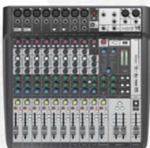
Signature 12 MULTI-TRACK

Also available: Signature Series Multi-track versions with multi-channel ultra-low latency USB audio interface -