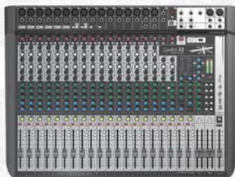
Signature 22 MULTI-TRACK

Soundcraft, Harman International Industries Ltd., Cranborne House, Cranborne Road, Potters Bar, Hertfordshire EN6 3JN, UK T: +44 (0)1707 665000 F: +44 (0)1707 660742 E: soundcraft@harman.com Soundcraft USA, 8500 Balboa Boulevard, Northridge, CA 91329, USA T: +1-818-893-8411 F: +1-818-920-3208 E: soundcraft-usa@harman.com